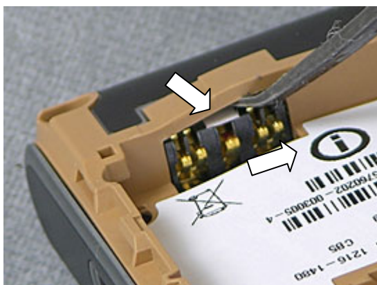
Location of the Liquid Intrusion Indicator (Remove battery cover and battery)

The following image shows the location of the liquid intrusion indicator.